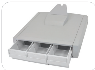
Primary Drawer – Triple SV41 LCD 97-726 SV42 LCD 97-719 SV41 Laptop 97-728 SV42 Laptop 97-721 Storage 97-795