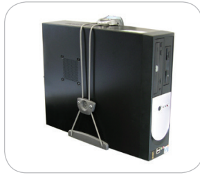
Universal CPU Holder 80-105-064