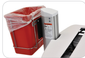
SV cart with waste basket* (5 quart) and wall mount bracket attached via Ergotron's VESA Mount Kit 97-512-009