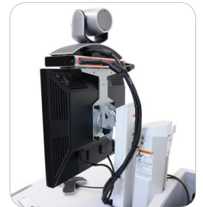
SV cart with SV Camera Shelf attached 97-776-194

© 2013 Ergotron, Inc. Literature made in US rev. 08/13/2013EA Content is subject to change without notification