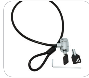
K-Slot Lock Kit 97-702