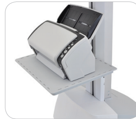
SV cart with scanner/printer* placed on Ergotron's Large Utility Shelf 97-540-053 and attached with the T-Slot Bracket 60-575-003