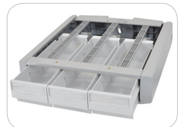
Supplemental Drawer – Triple SV41 97-729 SV42 97-722 Storage 97-796