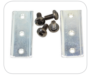
SV T-Nut Kit 97-631