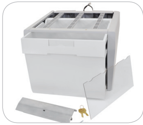
Envelope Drawer SV41 97-731 SV42 97-724