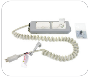
Medical-Grade Power Strip 97-466-214 (Available North America)