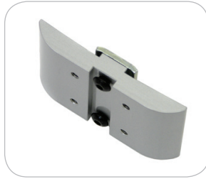
T-Slot Bracket 60-575-003