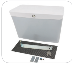
Storage Bin 97-740