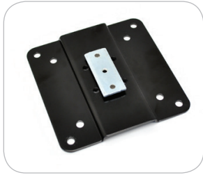
SV Rear VESA Mount Kit 97-512-009