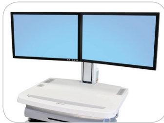
SV Dual Display Kit 97-574