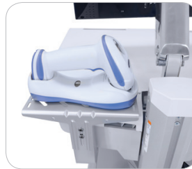
SV Scanner Shelf holds wireless scanner base onto either the front worksurface or onto the back side (shown) of the StyleView cart. 97-780-194