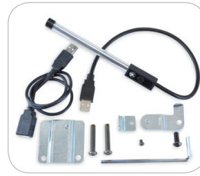
Task Light 97-754-002