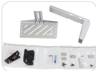
SV Scanner Shelf 97-780-194