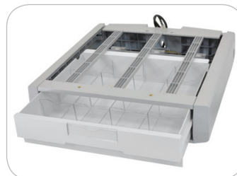
Supplemental Drawer – Single SV41 97-730 SV42 97-716 Storage 97-723