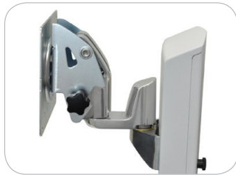
SV Cart LCD Pan Pivot Kit 97-650