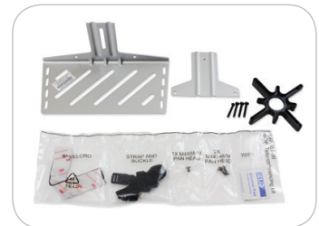
SV Camera Shelf 97-776-194