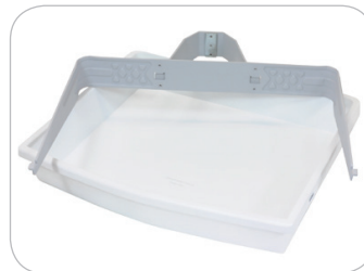
SV Front Tray 97-777-062