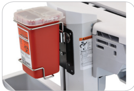
SV cart with small Sharps container* and wall mount bracket attached via Ergotron's VESA Mount Kit 97-512-009

*Ergotron sells brackets to attach the open-source products shown below but does not sell the products themselves