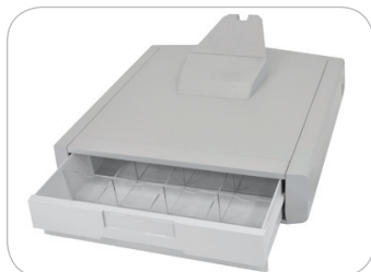
Primary Drawer – Single SV41 LCD 97-725 SV42 LCD 97-715 SV41 Laptop 97-727 SV42 Laptop 97-720 Storage 97-794