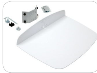
Utility Shelf 97-507-216