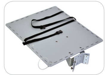
Large Utility Shelf 97-540-053