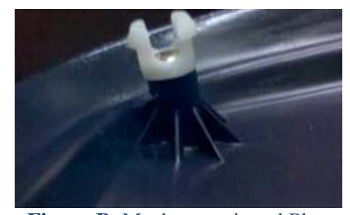
Figure B. Mushroom-tipped Plug

occasionally, one of the original mushroom tips may still be loose inside of the chair's backrest. To remove, use a needle-nose plier to grab and pull it out through the related hole in the back.