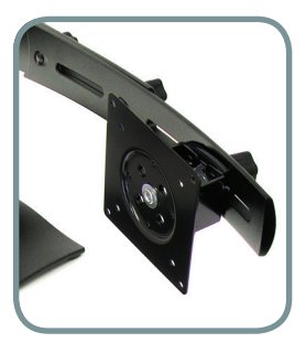
MONITORS CAN BE ALIGNED INTO A SEAMLESS CURVED PROFILE TO BENEFIT VIEWING.