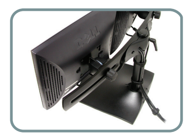
CABLES ARE GUIDED CLEANLY THROUGH CABLE