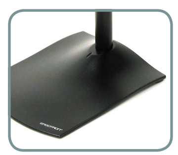
SLEEK, LOW-PROFILE BASE WITH DURABLE FINISH PROVIDES STABILITY AND SAVES SPACE.