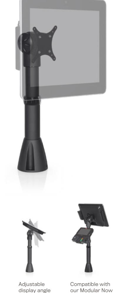
Easily adjust height

Model 9183 is an adjustable countertop POS mount that features easy height adjustment, an attractive appearance, internal cable management, and durable construction.