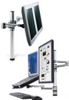
6912 Dual Monitor with Articulating Arm 6915 Notebook holder and Monitor Arm