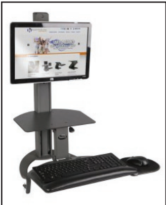
TASKMATE Go 6300 TaskMate Go