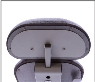
Optional 5010 Stance Move Seat Extension