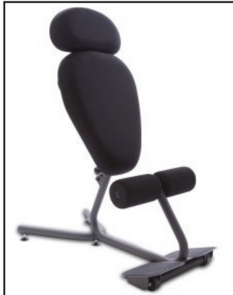
stance move 5100 Stance Move EXT