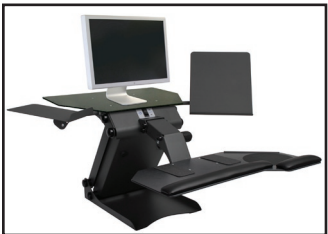
TASKMATE Executive 6100 TaskMate Executive