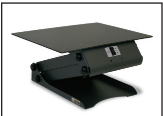
Surface TASKMATE 6252 Surface TaskMate