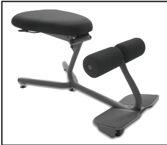
stance move 5000 Stance Move