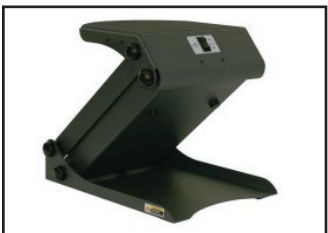
Surface TASKMATE 6254 Surface TaskMate