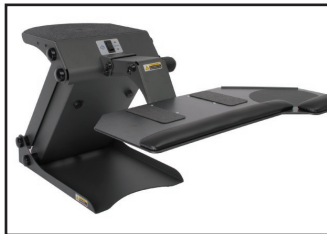
TASKMATE Journey 6200 TaskMate Journey