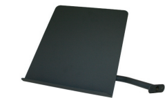
TaskMate Journey Optional Accessories 6142 Copy/Phone holder