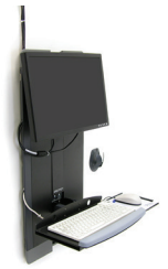
High Traffic Areas