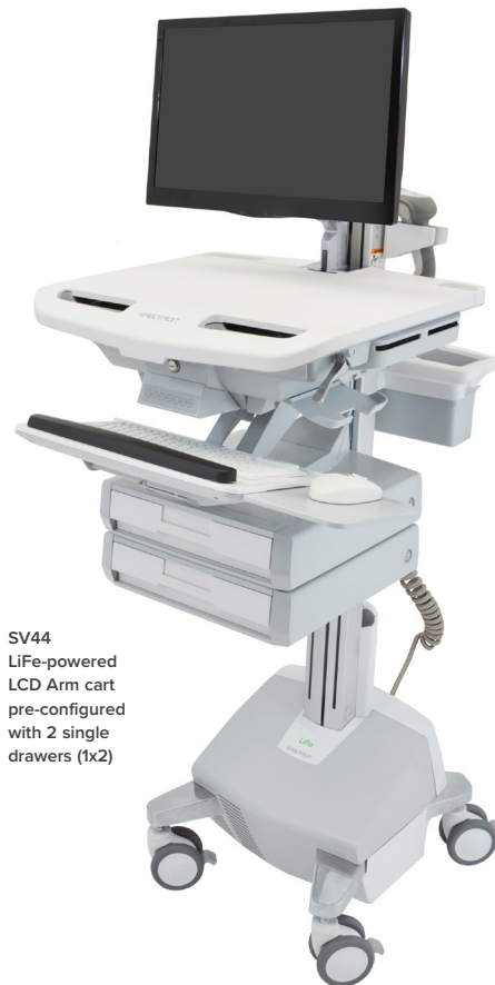
SV44 LiFe-powered LCD Arm cart pre-configured with 2 single drawers (1x2)