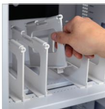
Pop-n-Go Bay Dividers are made of tough ABS polymer and can be moved to create the perfect bay width for your devices.