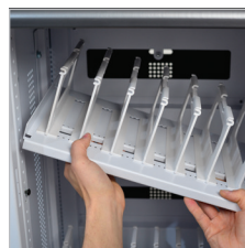
Each Lift-n-Set Shelf can be repositioned to create larger or smaller vertical spaces to fit your devices.

With YES Carts, one size fits all Chromebooks up to a 13" screen — even some 14"! Set the cart's bay width and shelf height for your device, then reconfigure when it's time for new devices. Mix and match with tablets, e-Readers, and hand-helds for even more flexibility. The YES Cart truly is the last cart you'll ever buy.