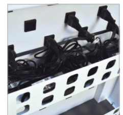
Cable bins measure 4.5" deep — plenty of room for power bricks and excess cord length.