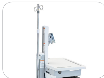
SV cart with IV Pole attached via Ergotron's StyleView IV Pole Clamp Kit