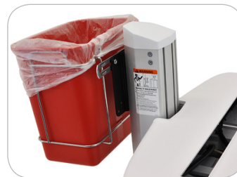
SV cart with waste basket (5 quart) and wall mount bracket attached via Ergotron's VESA Mount Kit 97-512-009