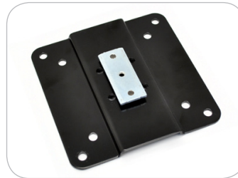
SV Rear VESA Mount Kit 97-512-009