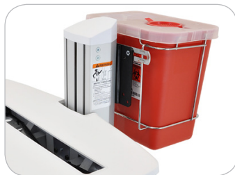
SV cart with large Sharps container (5 quart) and wall mount bracket attached via Ergotron's VESA Mount Kit 97-512-009