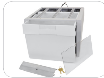
Envelope Drawer SV41 97-731 SV42 triple 97-724