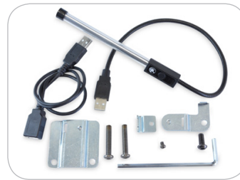
Task Light 97-754-002