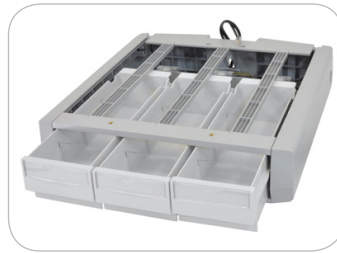
Supplemental Drawer SV41 triple 97-729 SV42 triple 97-722