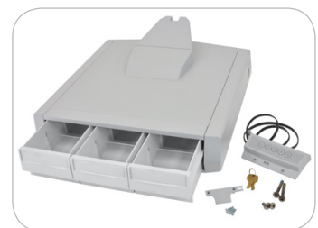
Primary Drawer SV41 Laptop triple 97-728 SV42 Laptop triple 97-721