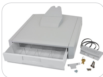
Primary Drawer SV41 Laptop single 97-727 SV42 Laptop single 97-720