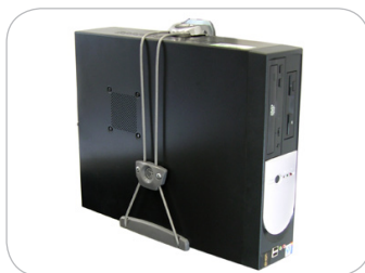
Universal CPU Holder 80-105-064