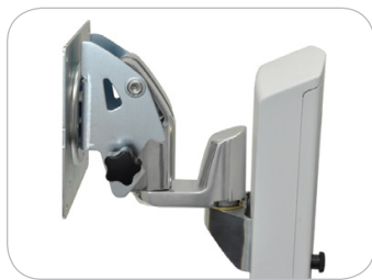
SV Cart LCD Pan Pivot Kit 97-650