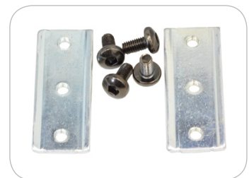
SV T-Nut Kit 97-631