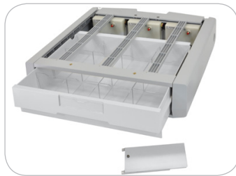
Storage Drawer 97-723