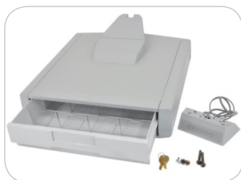
Primary Drawer SV41 LCD single 97-725 SV42 LCD single 97-715