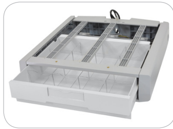
Supplemental Drawer SV41 single 97-730 SV42 single 97-716