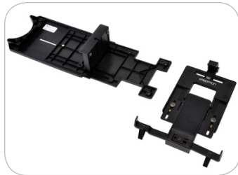
Universal Tablet Cradle 80-106-085