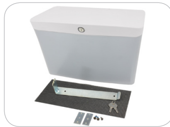
Storage Bin 97-740