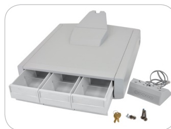
Primary Drawer SV41 LCD triple 97-726 SV42 LCD triple 97-719