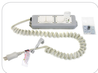
Medical-Grade Power Strip 97-466-214 (Available North America)