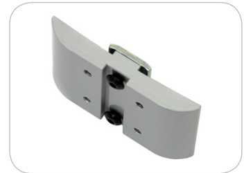
T-Slot Bracket 60-575-003