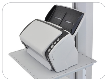
SV cart with scanner/prINTER placed on Ergotron's Large Utility Shelf 97-540-053 and attached with the T-Slot Bracket 60-575-003

© 2012 Ergotron, Inc. rev. 12/06/2012 Content is subject to change without notification