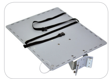
Large Utility Shelf 97-540-053