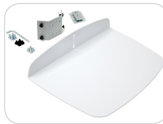
Utility Shelf 97-507-216