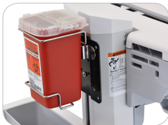
SV cart with small Sharps container and wall mount bracket attached via Ergotron's VESA Mount Kit 97-512-009