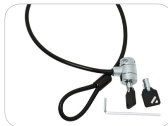
K-Slot Lock Kit 97-702