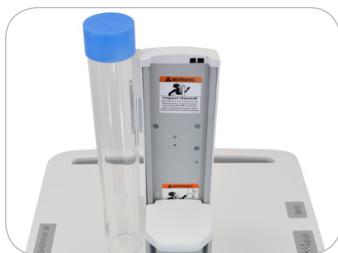
SV cart with medication cup dispenser adhered to 5" lift