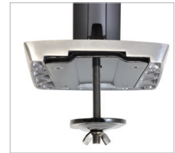
Grommet Accessory for WorkFit-A 97-692

© 2014 Ergotron, Inc. rev. 10/14/2014/EA Literature made in US Content is subject to change without notification