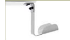
Mouse Holder ZMHCG