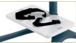
Small Equipment Shelf ZESSSB/CG Medium Equip. Shelf ZESMSB/CG Large Equipment Shelf ZESLSB/CG