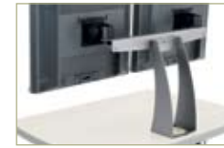
Dual Monitor (shown) 617SM Heavy-Duty Dual Monitor 627SM