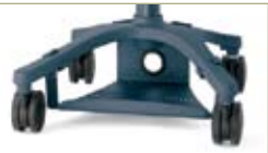
Base Storage Shelf ZBSSSB