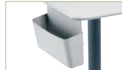
Side Bin ZSBCG