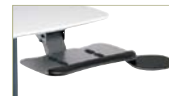
Keyboard & Mouse Caddy 169BK