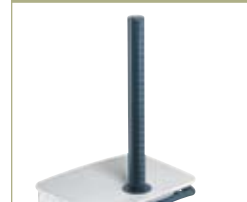
Extension Tube ZET26SB