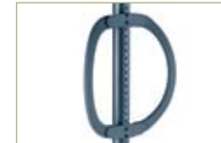
Pole Handle ZPHSB