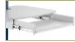
Keyboard Drawer ZKD20CG