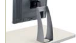
Single Monitor 615SM