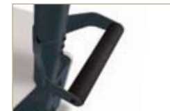
8" wide Handle ZHHSB