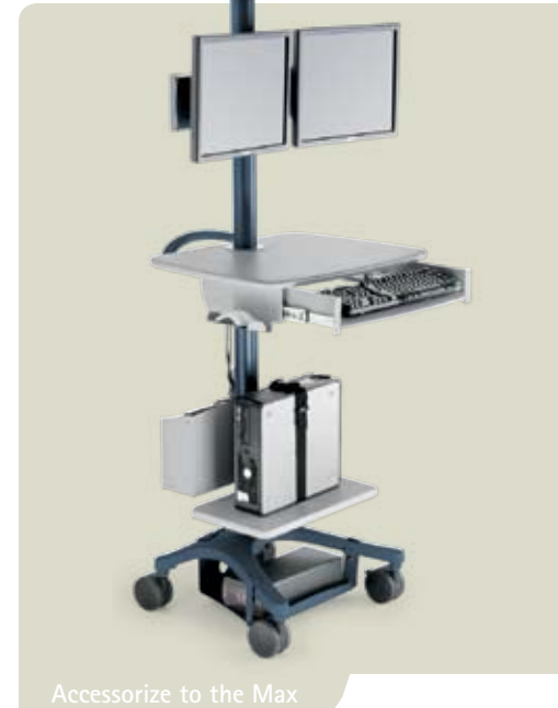
Accessorize to the Max