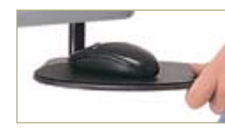
Swing-out Mouse Shelf 687BK