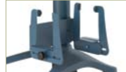
Standard SideRack ZSRSB Mini SideRack (shown) ZSMSB