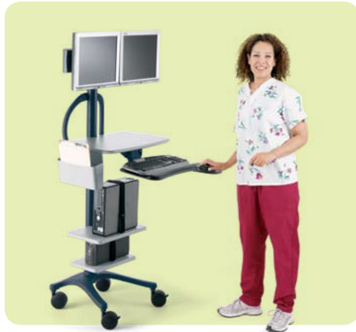
Small cart. Big options.