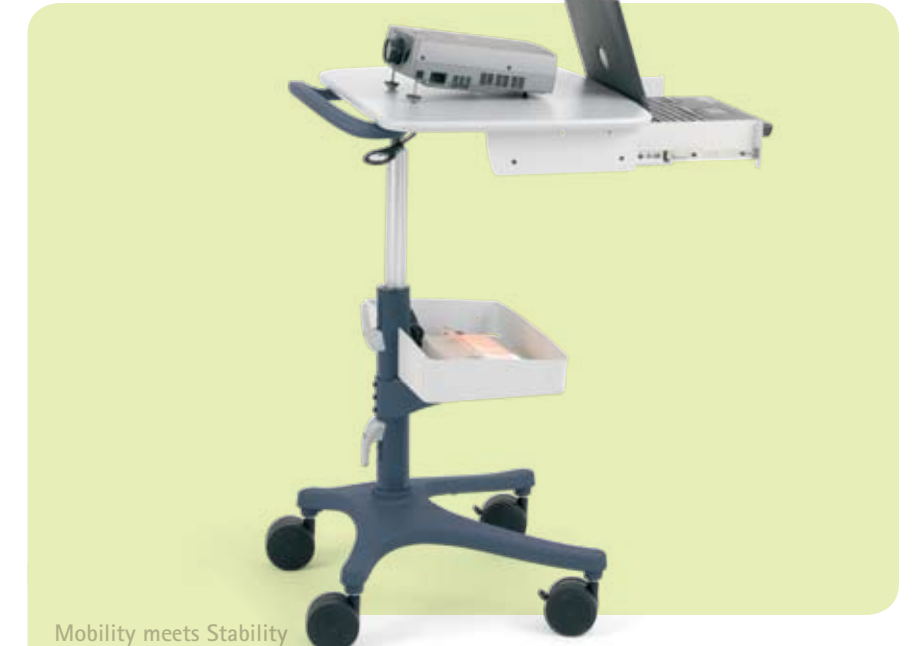
Mobility meets Stability