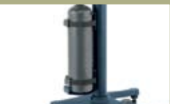
Tank Bracket ZTBSB