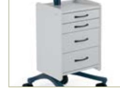
Drawer Enclosure ZDE01SB/CG