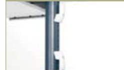
Hooks (set of 2) ZHKCG