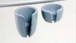
Large Probe Holder ZGCLCG Small Probe Holder ZGCSCG