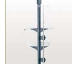
IV Pole ZIVSB