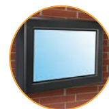
Wall (included - standard models only)