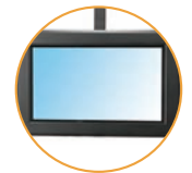
Ceiling (DGA110s accessory required)