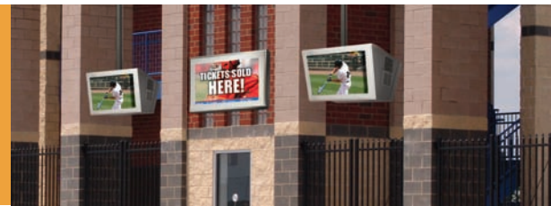
IDEAL FOR: 32-65" LARGE FLAT PANEL DISPLAYS

Protect your plasma and LCD displays from climate, theft and damage with solid steel Display Guards™ from Chief!