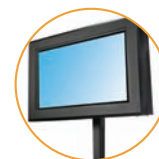
Floor Stand (DGA105s accessory required)