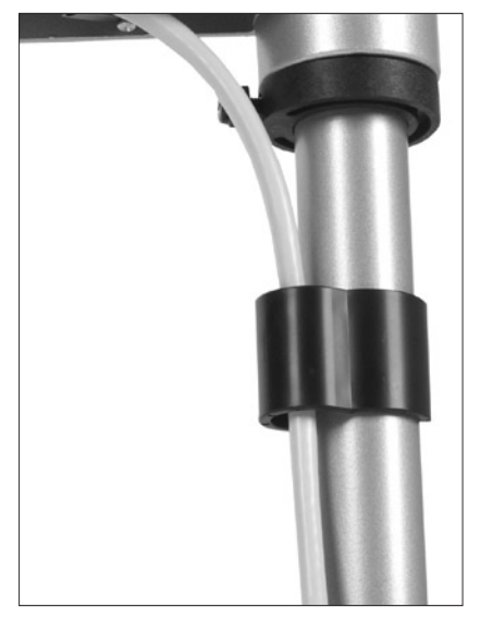
Use the cable clip to keep cables organized and in tact around the pole.

Your assembly and modifications are complete. If you need additional assistance regarding this product or if you need to return this arm for any reason, please contact our customer service department at 800.524.2744 to obtain a Return Authorization Number (R/A).