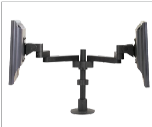
Configures to serve multiple users