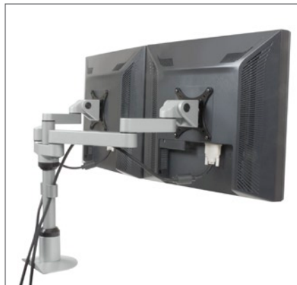
Integrated cable management