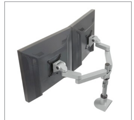
Reposition each monitor with one hand – no knobs to turn