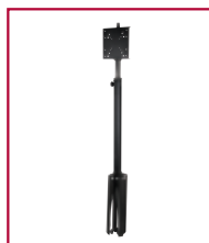
Collapsible design for easy transportation