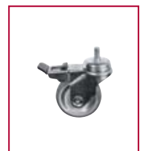
Accessory Caster (ACC332)