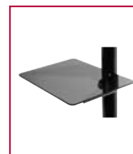
Accessory Shelf (ACC330)