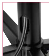
Internal cable management