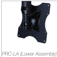
PRC-LA (Lower Assembly)