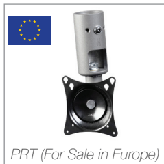
PRT (For Sale in Europe)