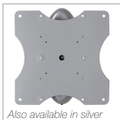
Also available in silver

Safety Set screw secures flat-panel to wall plate