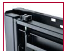
Four-point adjustment knobs