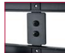
Wall Plate Spacers (sold separately)