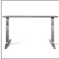
Hidden crossbar design for maximum clearance under worksurface.