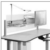
Sierra Tool Bar and accessories free up worksurface space.