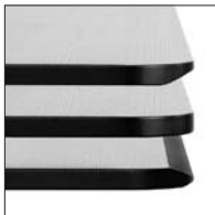
Slender 1/2" Silhouette worksurface collection with stylish edge profiles.