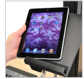
Tablet/Document Holder for WorkFit-S 97-558-200 (black) Includes lift handle