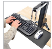
Large Keyboard Tray for WorkFit-S 97-653 (black)