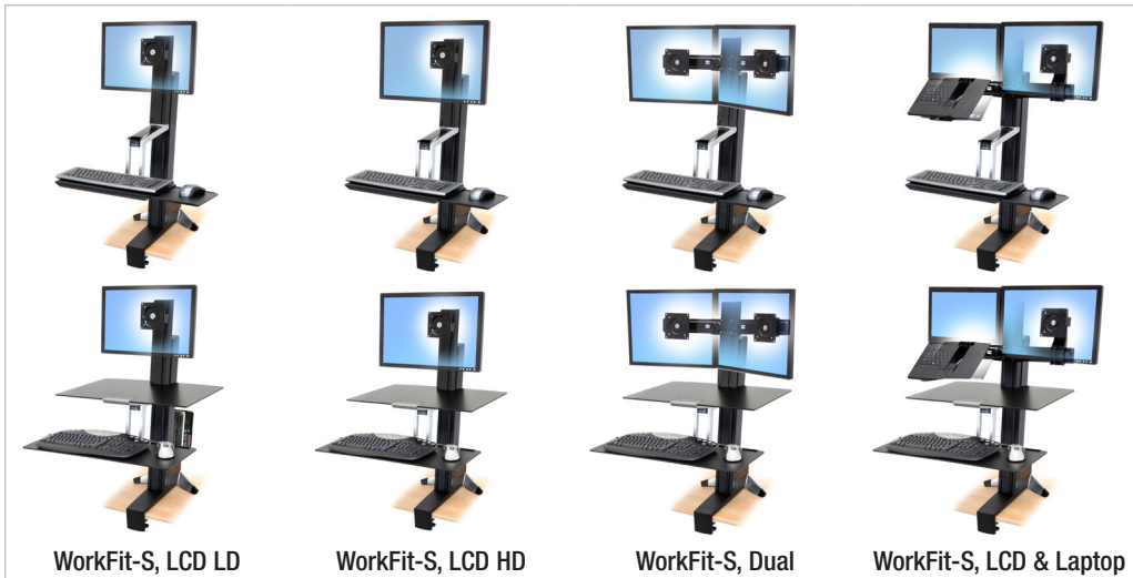
WorkFit-S, LCD LD