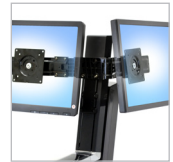
Hinged Bow for WorkFit-S 97-583-009 (black)