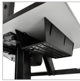
WorkFit-PD Cable Management Box and Cable Wrap Kit 97-667 (black)