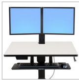
WorkFit-PD Dual Monitor Kit 97-663 (black)