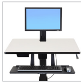
WorkFit-PD Single LD Monitor Kit 97-664 (black)