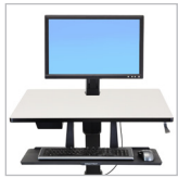
WorkFit-PD Single HD Monitor Kit 97-665 (black)