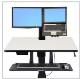
WorkFit-PD LCD & Laptop Kit 97-662 (black)

Durable, robust structure tested and certified to ANSI/BIFMA X5.5-2008w