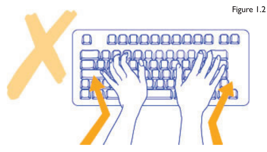
Splay & Ulnar Deviation Adjustment

There is usually a discrepancy between your shoulder width and keyboard width when you place you fingers on the home row of keys. You compensate by angling your wrists outward (Figure 1.2 - ulnar deviation). Rather than have this happen, the Goldtouch Adjustable Keyboard splits the horizontal plane relieving this awkward posture. The aim is to allow your wrists to be straight which in turn will increase your comfort level.