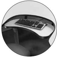
Secondary surface lift allows a separate keyboarding area