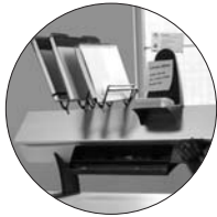
Add on Proxi or Sierra Accessories to keep organized