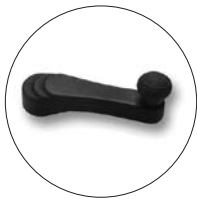
Crank adjustment meets tight budget requirements