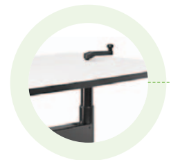
The Proliftix Crank handle can be removed once the height is set.