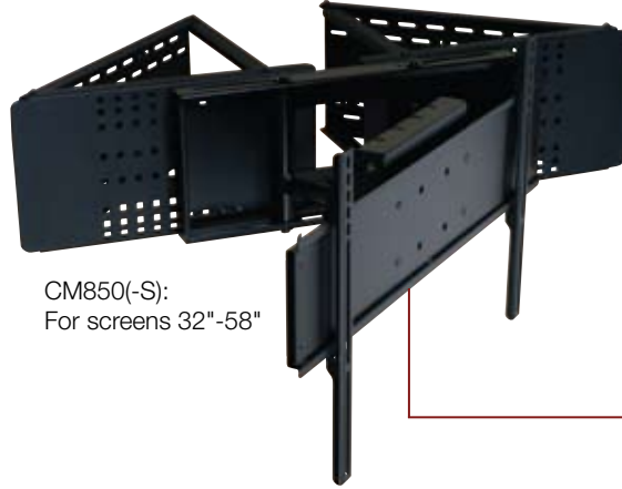
CM850(-S): For screens 32"-58"