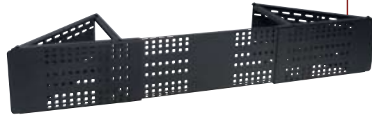
CM60(-S): For screens 40"-60"