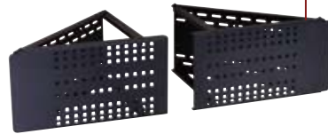
CM50(-S): For screens 32"-50"