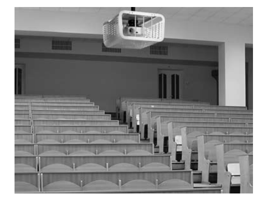
Projector and mount not included

Peerless Industries, Inc. 3215 W. North Avenue, Melrose Park, IL 60160