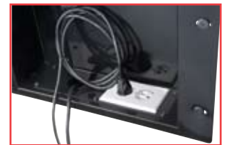
Removeable outlet receptacle and cable management access plates on top and bottom

Peerless Industries, Inc. 3215 W. North Avenue, Melrose Park, IL 60160