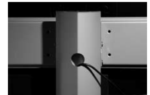
Internal cord and cable management