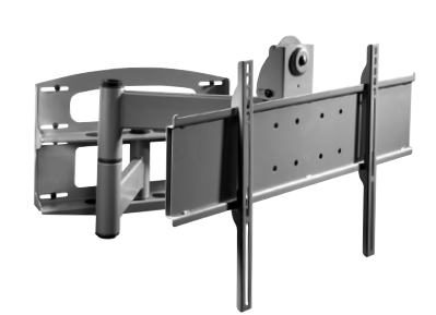
Universal model includes universal adapter plate