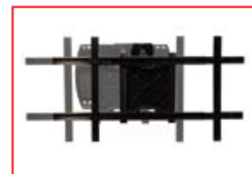
10.75" of horizontal adjustment