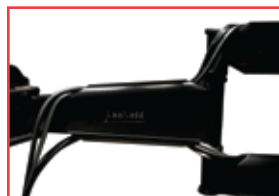
U-Groove covers provide 1" clearance for cables