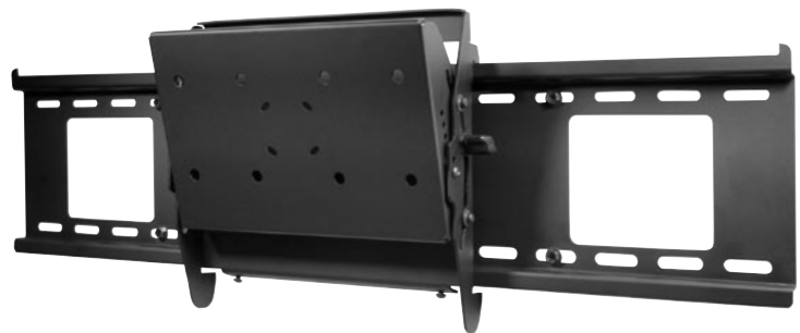
ST24D 32" and above

The SmartMount Dedicated line provides screen specific solutions for mounting medium to large sized flat panel screens. Both flat and tilting models are available and compatible with Peerless' comprehensive inventory of screen-specific PLP adapter plates, ensuring a precise fit for almost any plasma or LCD screen. Additionally, installers can choose from either a wall plate for 16" stud centers, perfect for any portrait-style applications, or a more versatile wall plate for 16"-24" stud centers. All models ship pre-assembled for fast and easy installation.