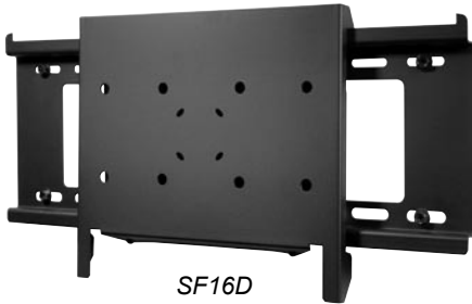
SF16D 22" and above