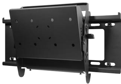
ST16D 22" and above