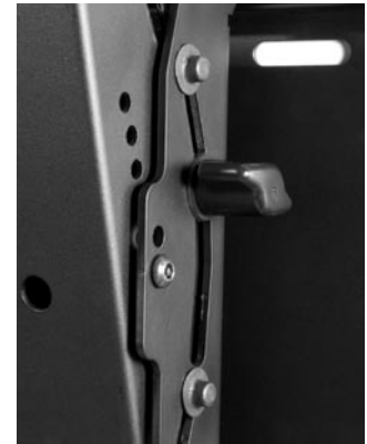
Incre-Lok feature available on tilting models