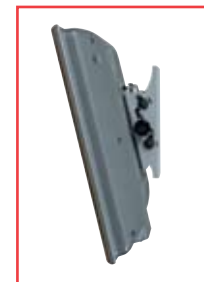
Adjustable +15/-5° tilt