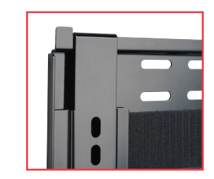
Industrial strength Velcro® latching system holds screen in place against the wall plate preventing accidental bump-off or horizontal adjustment

(800) 865-2112 (708) 865-8870 Fax: (708) 865-2941