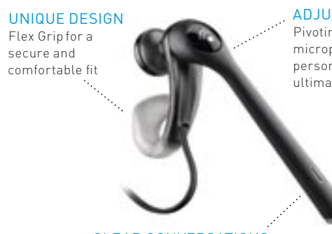
CLEAR CONVERSATIONS Noise-canceling microphone reduces unwanted background noise

Innovative design for easy one-handed placement