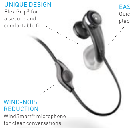
EASY-TO-USE Quick one-handed placement