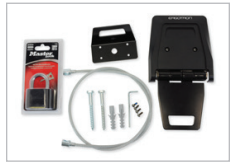
Security Bracket Accessory Kit 97-735

Up to 47% smaller and lighter than competitive offerings