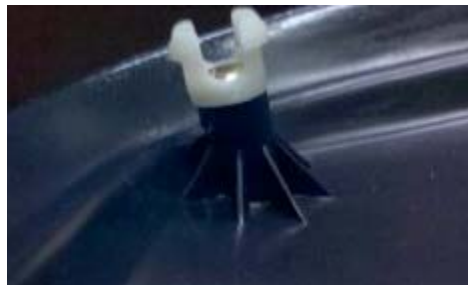
Figure B. Mushroom-tipped Plug

step 3. Fasten replacement mushroom tip(s) to the same area of the backshell using the original screw.