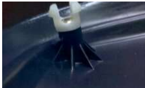
Figure B. Mushroom-tipped Plug

step 3. Fasten replacement mushroom tip(s) to the same area of the backshell using the original screw.