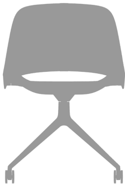
4 STAR BASE