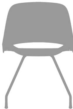
4 LEG BASE