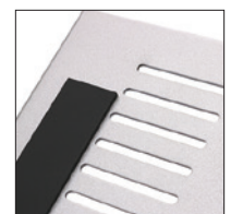
Anti-vibration pads hold laptop securely while vents assist in cooling.