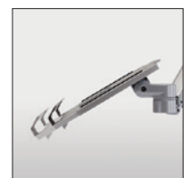
Accommodate laptops up to 15.4".

Reinforced steel construction with anti-vibration pads ensure that your laptop is stable and quiet while the vented platform design allows your laptop to stay cool. The Workrite Universal Laptop Holder ships completely assembled. Simply adjust the laptop holder height to match your laptop computer's size, attach to any 75 mm VESA compliant monitor arm with the provided screws, and get to work.