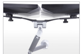
View of tilting feature (capable of up to +20^{\circ}/-25^{\circ} angle towards the user).