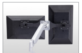
The bracket enables both horizontal and vertical orientations.