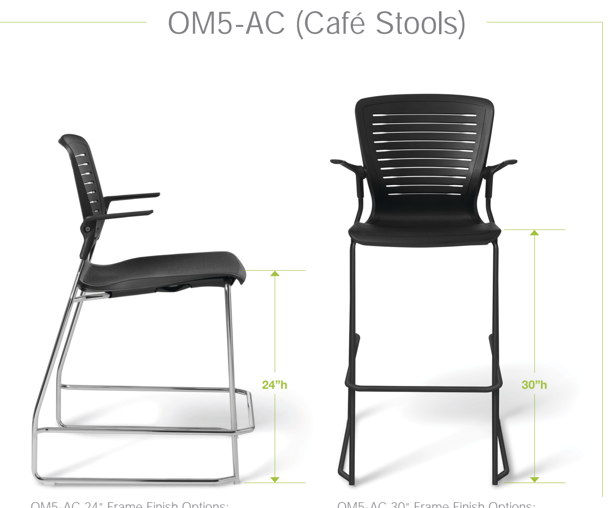
OM5-AC 24" Frame Finish Options: (color-matched modern black or chrome)