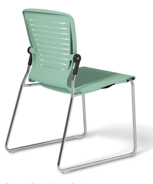
Chrome Finish Model Options: OM5-AS, OM5-AC