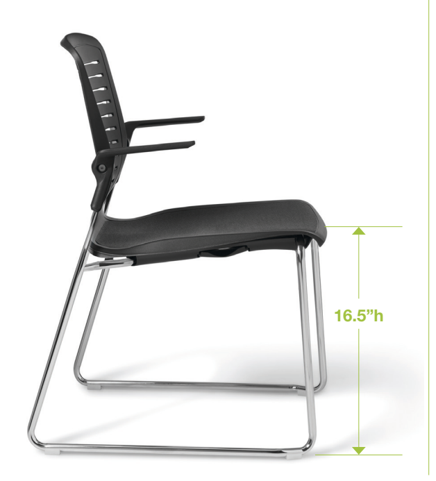
OM5-AS Frame Finish Options: (color-matched modern black, color-matched palladium grey or chrome)