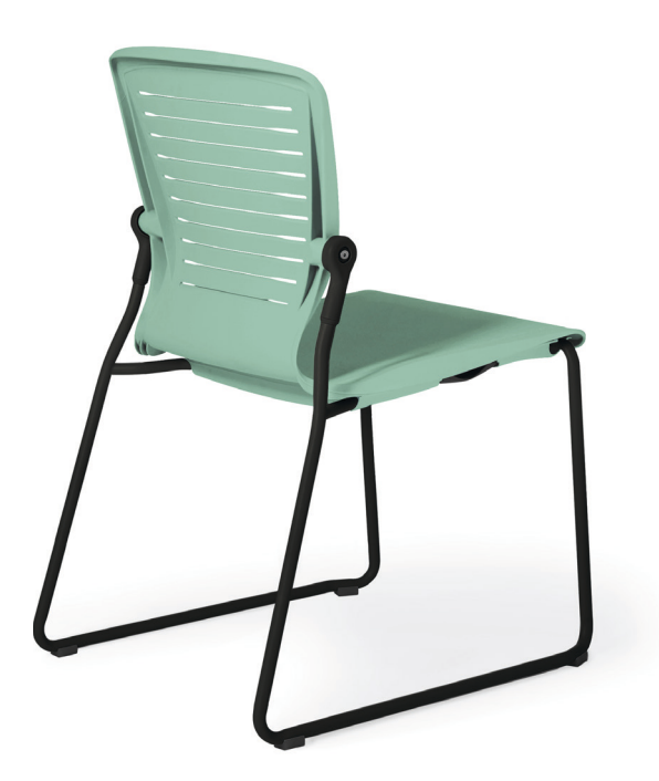
Black Powdercoat Finish Model Options: OM5-AS, OM5-AG, OM5-AC