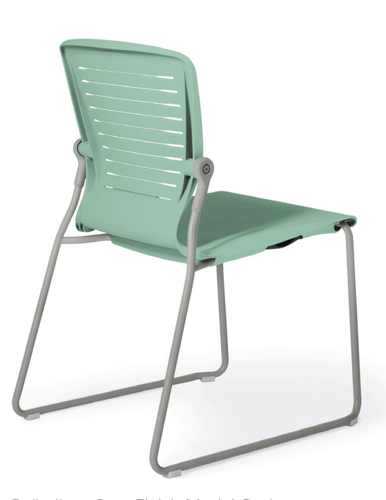
Palladium Grey Finish Model Options: OM5-AS, OM5-AG