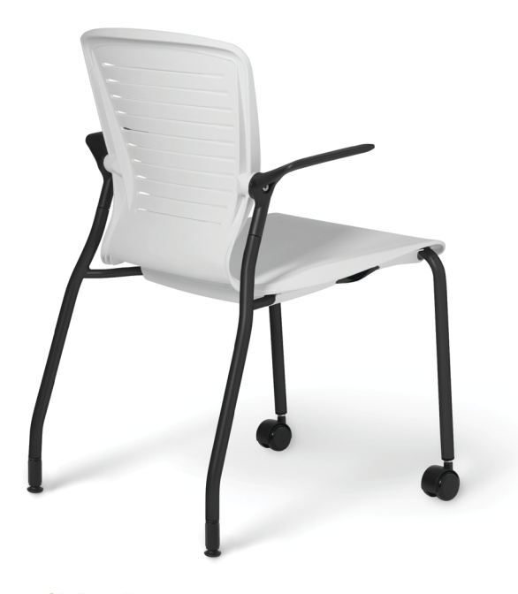
w/ Wheelbarrow caster option: Hooded swivel casters w/ designer contoured glides