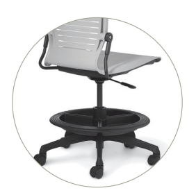
OM5 Active Tool Tray

Available on Active Guest only. Mobility Casters on front legs, Stability Glides on rear legs