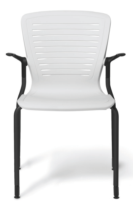
w/ Active Glides: Designer contoured glides w/ non-marking convex bottom