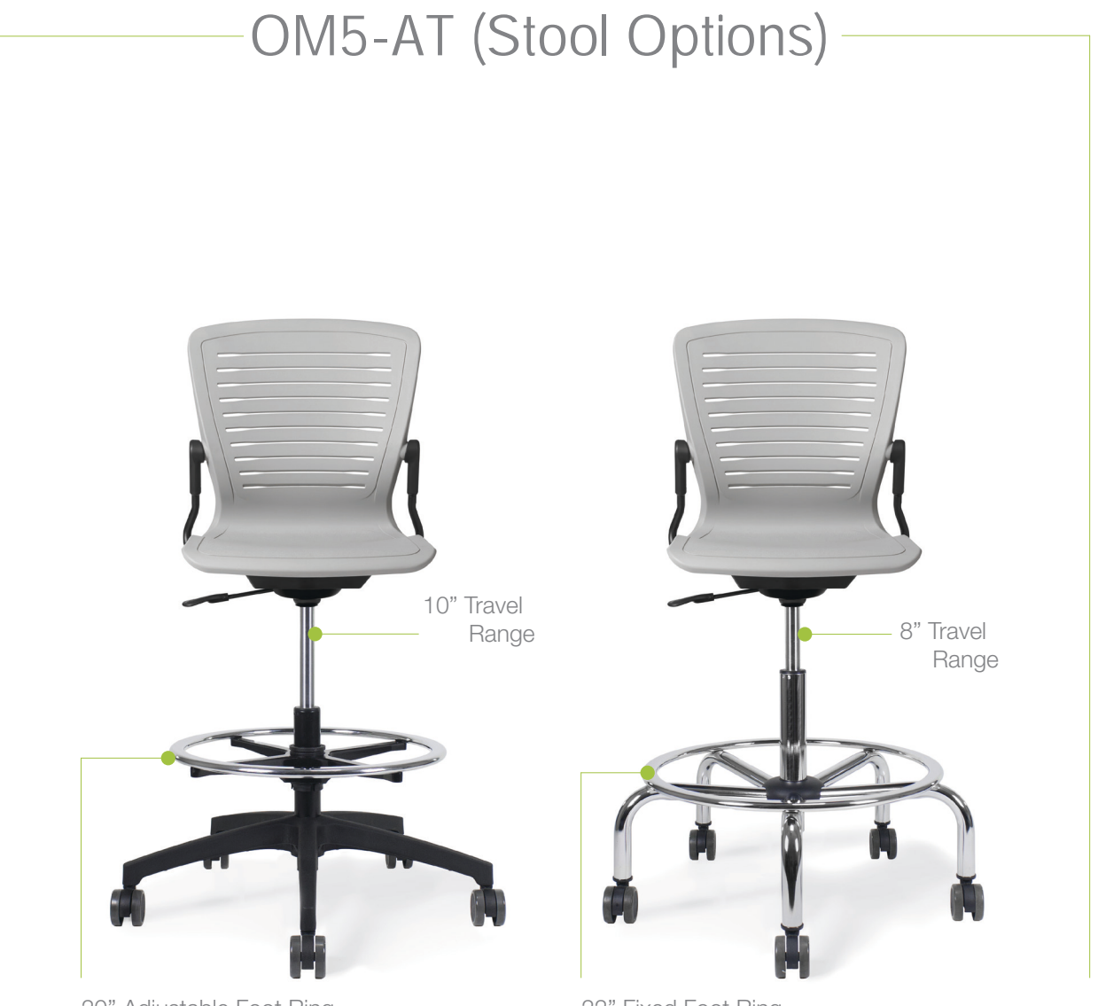
20" Adjustable Foot Ring