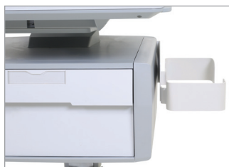
SV Sharps Container Drawer-Mount Bracket Kit