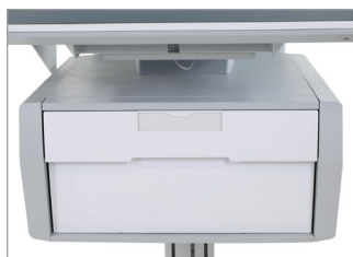
SV Primary Storage Drawer, Single Tall