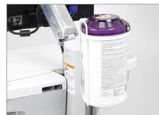
T-Slot Wipes Holder