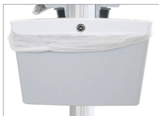
SV Storage Bin