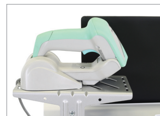
SV Scanner Shelf