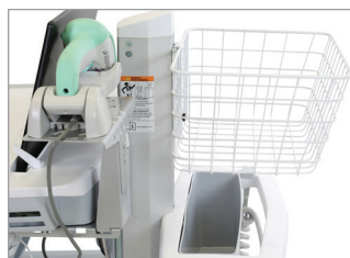
SV Wire Basket, Small