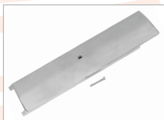
SV Drawer Travel-Stop

Download additional resources at ergotron.com .