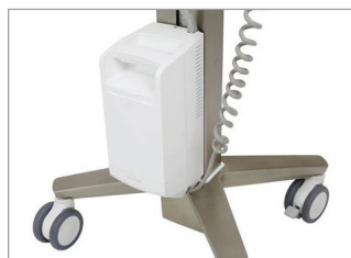
LiFeKinnex Power System