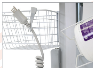
Coiled Extension Cord Accessory Kit