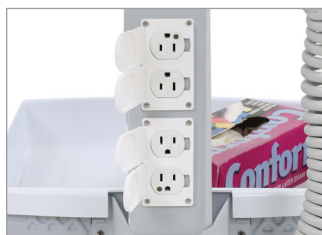
Medical-Grade Power Strip