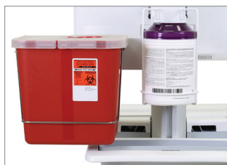
Sharps Container T-Slot Bracket Kit