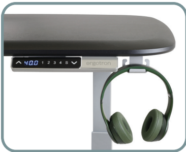
ACCESSORY HOOK: HANG HEADPHONES, BACKPACKS AND PARKAS—OR USE IT AS A BOTTLE OPENER TO OPEN A LITTLE FUN