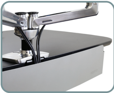
REAR CABLE MANAGEMENT TRAY HIDES CLUTTER FOR 360-DEGREE VIEWS OF A NEAT WORKSTATION