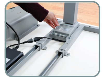
EASY THREE-STEP ASSEMBLY REQUIRES ONLY FOUR SCREWS TO ATTACH THE LEGS AND POWER SOURCE WITH NO ADDITIONAL ADJUSTMENTS NEEDED

Download additional resources at ergotron.com . For more information: NORTH AMERICA: 800.888.8458 / +1.651.681.7600 / insidesales@ergotron.com EMEA: +31.33.45.45.600 / info.eu@ergotron.com APAC: apaccustomerservice@ergotron.com Worldwide Custom Sales: custom@ergotron.com