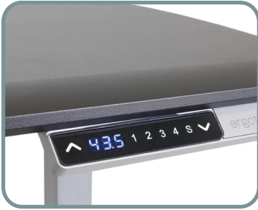
TOUCH DISPLAY STORES FOUR HEIGHTS FOR A PERSONALIZED, ERGONOMIC FIT