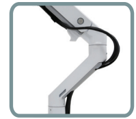
CABLES ROUTE BENEATH THE ARM, OUT OF THE WAY