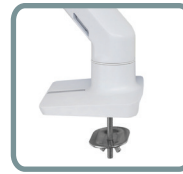
INCLUDED: GROMMET MOUNT ATTACHES THROUGH SURFACE HOLES