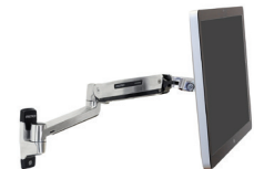
LX HD Sit-Stand Wall Mount LCD Arm