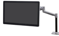
LX HD Sit-Stand Desk Mount LCD Arm