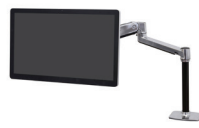
LX Sit-Stand Desk Mount LCD Arm