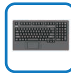
Compact 1U Design

Simply plug the Trackball keyboard into a USB port and you will be up and running. No drivers required.