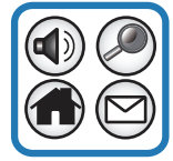
Multimedia and Internet Controls