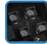
Quiet Membrane Key Switches