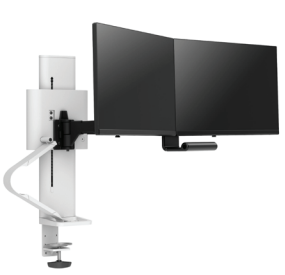
Dual with Panel Clamp