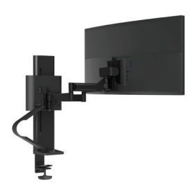
Single with Panel Clamp