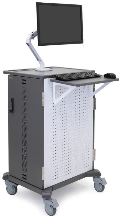
98-381-F56 YES24/36 PEGBOARD SHELF