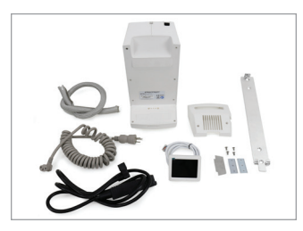
LiFeKinnex Smart Battery Dock

MOBOTIX® is a registered trademark of MOBOTIX AG Corporation. Products referenced are not built and sold by Ergotron. They are purchased through third parties.