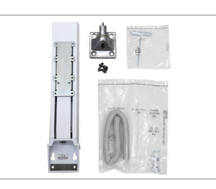
SV HD Monitor Kit