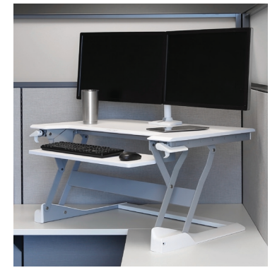
SHOWN WITH WORKFIT-TL SIT-STAND WORKSTATION

FACH MONITOR HAS INDIVIDUAL UP/DOWN TILT